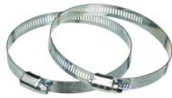
Metal Worm Gear Clamps