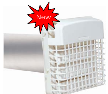
ProGard Exhaust Hood