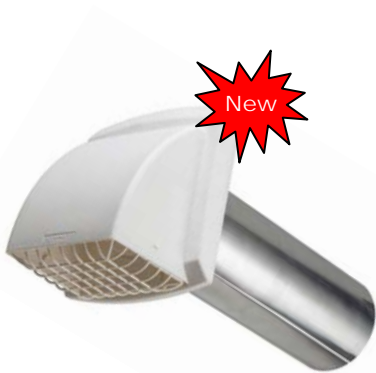
ProMax Exhaust Hood