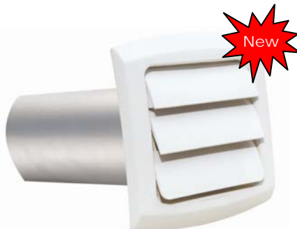
ProVent Exhaust Hood