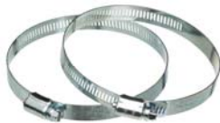
Metal Worm Gear Clamps