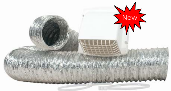
ProMax Dryer Vent Kit