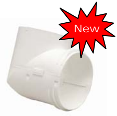
Dryer To Duct Connector