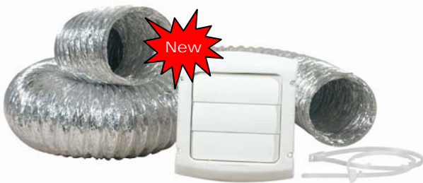
ProVent Dryer Vent Kit