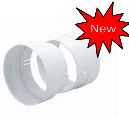
Lint Clean Out